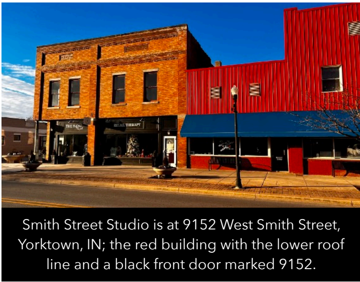
Smith Street Studio is at 9152 West Smith Street, Yorktown, IN; the red building with the lower roof line and a black front door marked 9152.